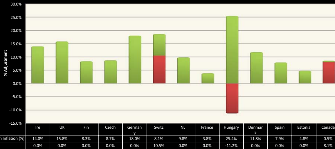
Construction/ Currency Comparison